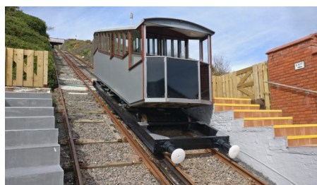
Aberystwyth Cliff Railway

Day 2 – Today commences with a visit to Carmarthen , said to be the oldest town in Wales. Once an important Roman sea fort, the remains of an amphitheatre are still visible. We then continue to Aberglasney Gardens . With 10 acres and an extraordinary Elizabethan cloister garden at its heart, this flourishing paradise offers much to explore. Dating back many centuries, the gardens were 'rediscovered' in the 1990s and consequently restored based upon historical research. Whilst here we will enjoy an included cream tea.