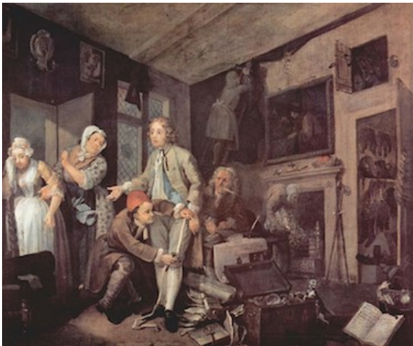
I The Heir

6. Which 18 th century English artist painted a series of 8 paintings called The Rake's Progress , showing the decline and fall of Tom Rakewell, a spendthrift son and heir of a rich merchant?