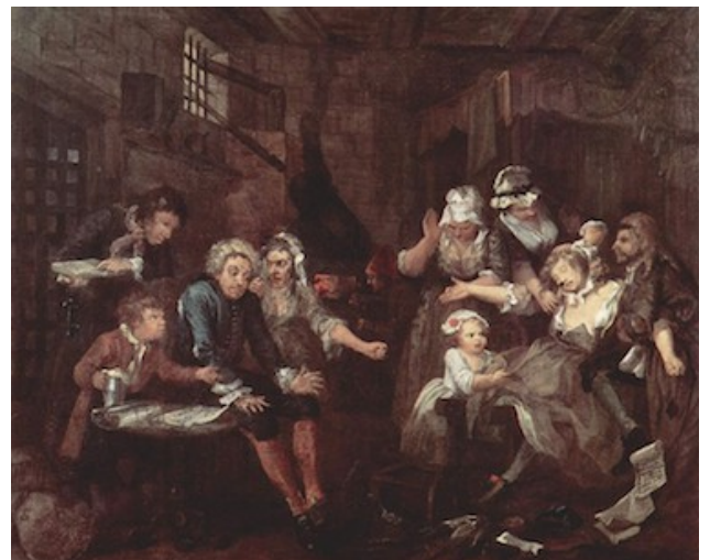
VII The Prison

7. Who was the English art forger, born in 1917, who claimed to have forged more than 2000 paintings by over 100 artists?